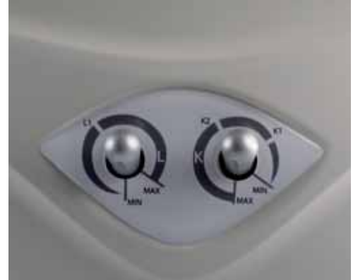
Potentiometer for Lux and Kelvin

POLARIS R2 is characterised by shells entirely in aluminium, which assures a high robustness. The studied geometry of reflectors, in combination with each LED source, allows to realise a luminous flux which is homogeneous, clean and without shadows. POLARIS R2 is equipped with two potentiometers which allow to adjust both light intensity (from 8.000 lux to 35.000 lux) and colour temperature (from 4.200 K to 5.800 K).